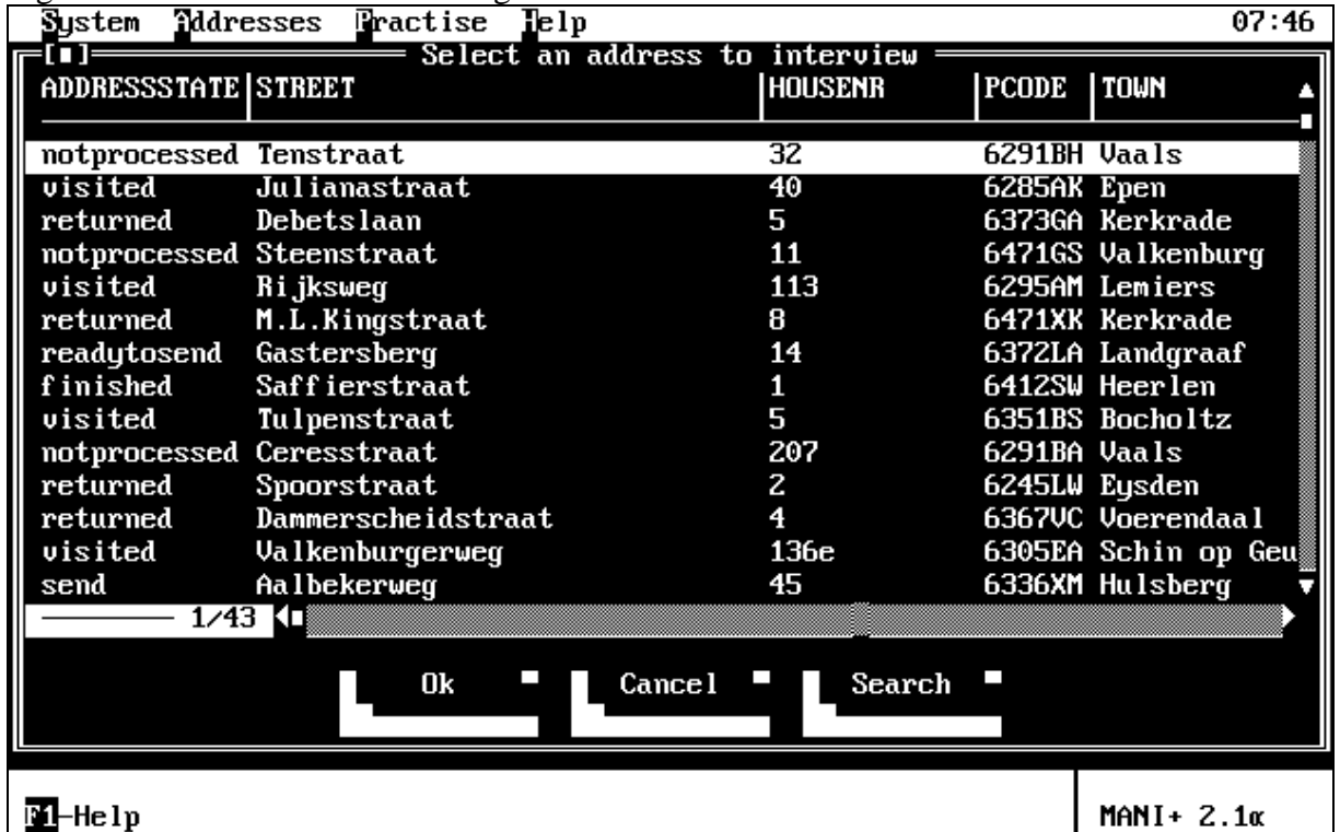
Figure H. The select address dialog

The definition of this dialog in the ManiPlus setup looks as follows: