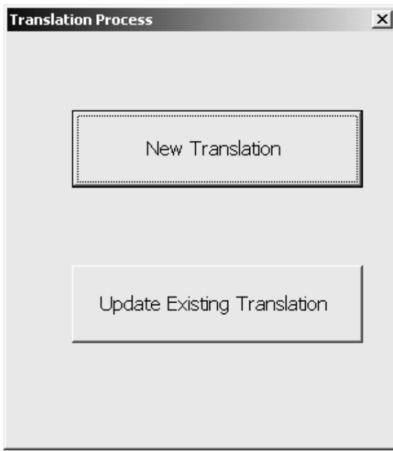
Figure 2. The starting dialog for the translation system

By clicking on the button 'New translation' the translation process is started. You will have to browse to the translation database (without translated texts at first) and start typing in translations, like in Figure 1.